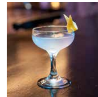
CLASSIC VODKA MARTINI $22 Vodka and Dry Vermouth