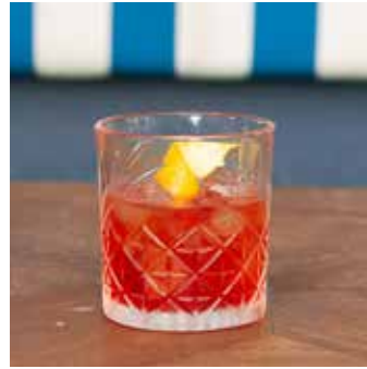
CLASSIC NEGRONI $22 Gin, Campari & Carpano Antica Formula.