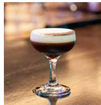
ESPRESSO MARTINI $22 Vodka, coffee liqueur & organic Byron Bay Coffee.