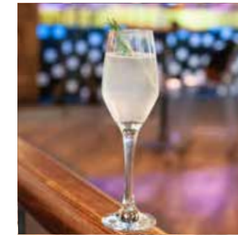
SMOKING MARY $11 Lychee syrup, soda and rosemary.