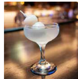
LYCHEE MARTINI $22.50 Vodka, Soho, Dry Vermouth and sugar syrup.