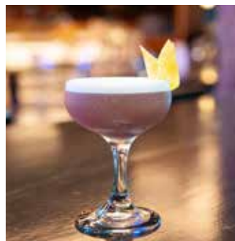
SLOE SOUR $22 Sloe gin, Aperol, Crème de Violette, lemon juice and egg white.