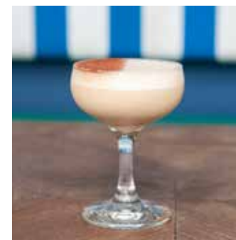
FLAT WHITE ESPRESSO MARTINI $23 Baileys Irish Cream liqueur, vodka & coffee