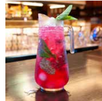
PINK LYCHEE $40 Vodka, soho lychee, lemon, sugar & raspberry cordial.