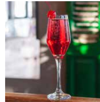
RASPBERRY FIZZ SPRITZ $11 Raspberry syrup and non-alcoholic prosecco.