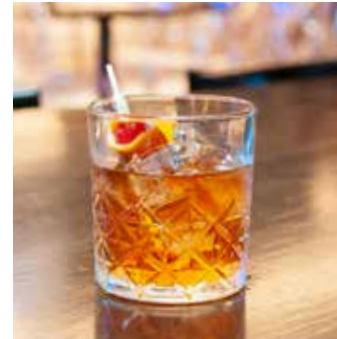
BOBBY BURNS $22 Glenlivet 12, Martell VS, Benedictine, Dolin Sweet Vermouth and Peychaud's Bitters