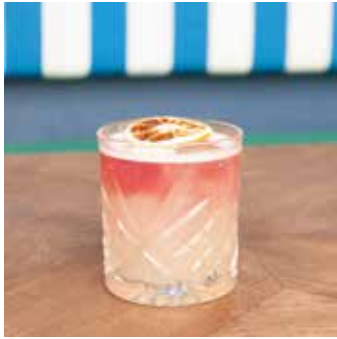
NEW YORK SOUR $22 Bourbon, lemon, and merlot.