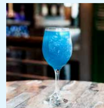
FROZEN BLUE LAGOON $16