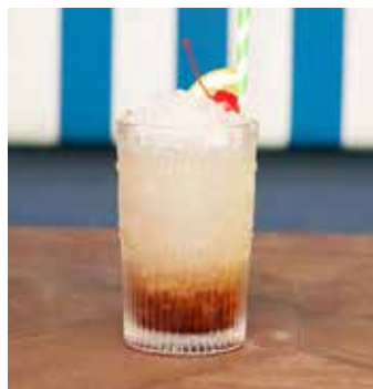
LONG ISLAND ICED TEA $25 Tequila, rum, vodka, gin, cointreau, lemon, sugar & cola.