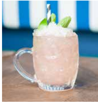
CRANBERRY MOSCOW MULE $20 Vodka, ginger beer, cranberry juice & lime juice.