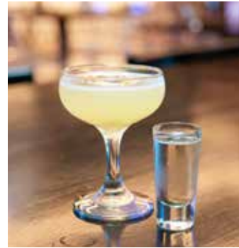
PORNSTAR MARTINI $22 Vodka, Passoa passionfruit liquor, Monin vanilla syrup, passion fruit puree & side shot of prosecco.