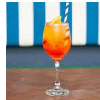
APEROL SPRITZ $16 Equal parts Aperol & prosecco, a dash of soda, ice and a wedge of orange.