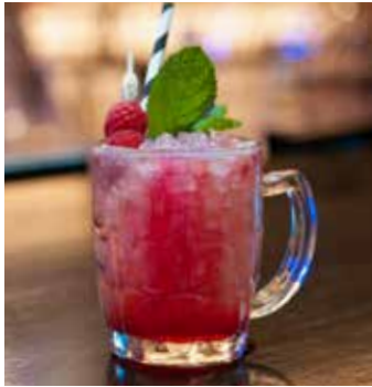
CUPIDS BOW $22.5 Vanilla Vodka, raspberries, Soho, apple juice, rose water, mint and coconut dust