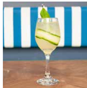
ELDERFLOWER SPRITZ $18 Gin, Elderflower liqueur, lemon juice, soda water & prosecco.