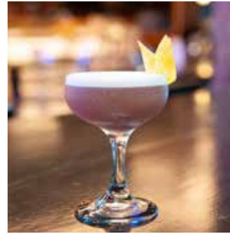
SLOE SOUR $22 Sloe gin, Aperol, Crème de Violette, lemon juice and egg white.