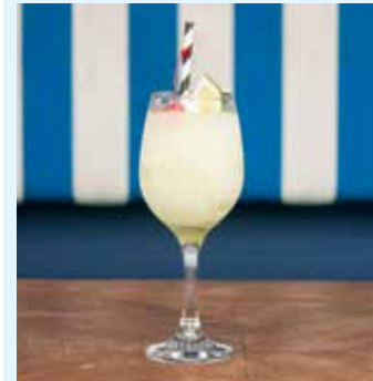
FROZEN LIME MARGARITA $16