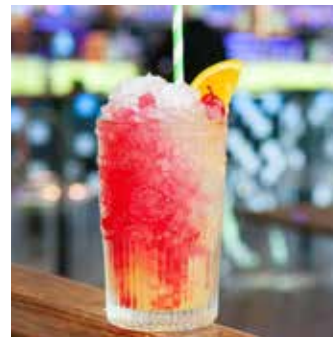
CALIFORNIA LEMONADE $10 Passionfruit puree, American lemonade & grenadine.