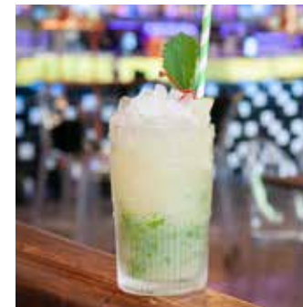
VIRGIN MOJITO $10 Mint leaves, sugar, apple juice, bitters & soda water.

$25 EXPRESS LUNCH with a FREE house beer or a glass of house wine 12-4PM