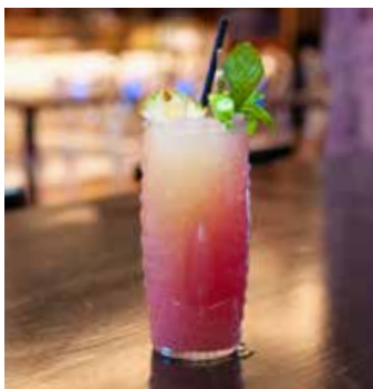
ZOMBIE $27 Dark rum, OP rum, falernum, demerara syrup, lime, Pernod Absinthe, grenadine, pineapple & grapefruit juice. (max of 2 per person)