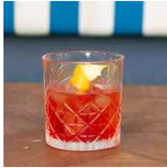
CLASSIC NEGRONI $22 Gin, Campari & Carpano Antica Formula.