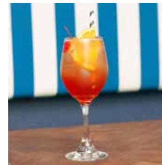
SLOE GIN SPRITZ $19 Sloe gin, fresh lemon juice, sugar syrup & Squealing Pig Prosecco.