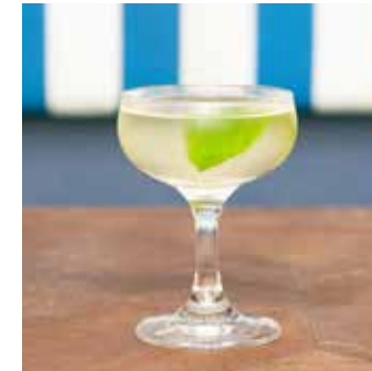
ELDERFLOWER SOUTHSIDE $21 Gin, St Germain Elderflower liqueur, lime juice & mint.