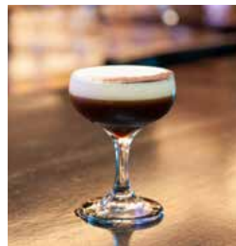
ESPRESSO MARTINI $22 Vodka, coffee liqueur & organic Byron Bay Coffee.