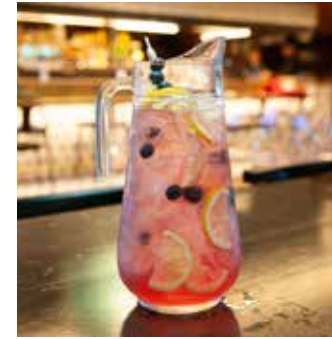
DOWNTOWN BRAMBLE $40 Cin, Creme De Mure, lemon and topped with tonic.