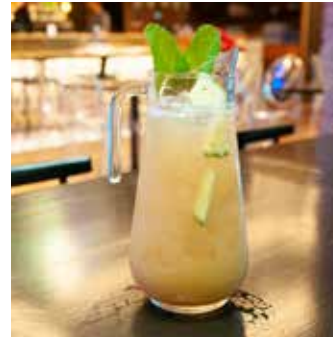
SUMMERS PASSION $40 Vanilla vodka, Frangelico, lemon, pineapple juice, passionfruit puree & topped with ginger beer