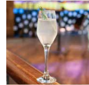
SMOKING MARY $11 Lychee syrup, soda and rosemary.