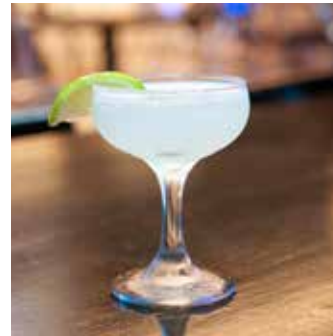
CLASSIC MARGARITA $21 Tequila, Cointreau, lime juice & simple syrup.