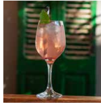
ROSE LEMON SQUEEZE $11 Rose syrup and lemon juice topped up with Not Guilty Rose Spritz