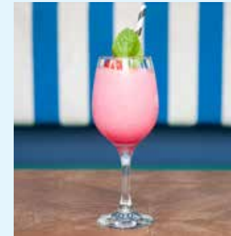
STRAWBERRY MARGARITA $16