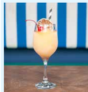
MANGO MARGARITA $16