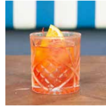
OLD FASHIONED $21 Scotch whisky, Angostura bitters & Simple syrup.