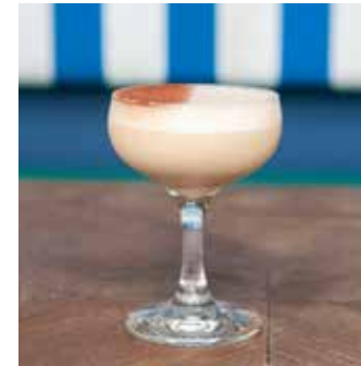
FLAT WHITE ESPRESSO MARTINI $23 Baileys Irish Cream liqueur, vodka & coffee