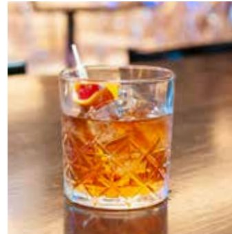
BOBBY BURNS $22 Glenlivet 12, Martell VS, Benedictine, Dolin Sweet Vermouth and Peychaud's Bitters