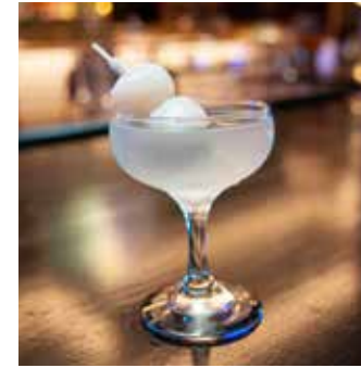
LYCHEE MARTINI $22.50 Vodka, Soho, Dry Vermouth and sugar syrup.