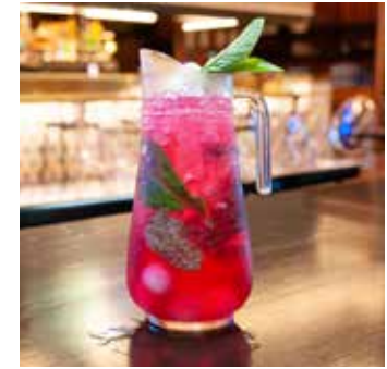
PINK LYCHEE $40 Vodka, soho lychee, lemon, sugar & raspberry cordial.