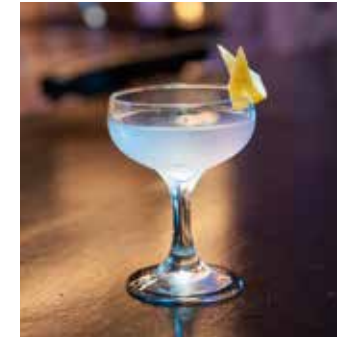
CLASSIC VODKA MARTINI $22 Vodka and Dry Vermouth