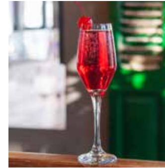
RASPBERRY FIZZ SPRITZ $11 Raspberry syrup and non-alcoholic prosecco.