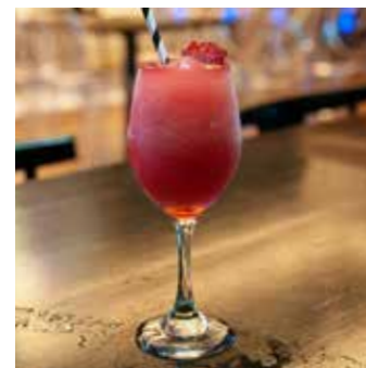
STRAWBERRY MARGARITA $16