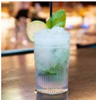
DOWNTOWN SIPPER $20 Gin, Elderflower, ginger, lime, basil and lemonade