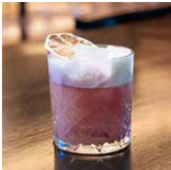
NEW YORK SOUR $20 Bourbon, lemon, egg white and merlot.