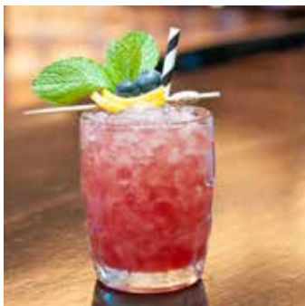
GRANNY'S BLACKBERRY PRESS $20 Creme De Mure, Lemoncello, apple juice, blackberries and mint.