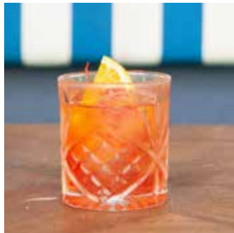
OLD FASHIONED $19.5 Scotch whisky, Angostura bitters & Simple syrup.