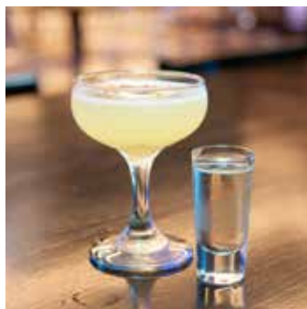
PORNSTAR MARTINI $20 Vodka, Passoa passionfruit liquor, Monin vanilla syrup, passion fruit puree & side shot of prosecco.