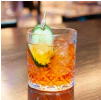
UNUSUAL NEGRONI $20 Gin, Lillet Blanc and Aperol.