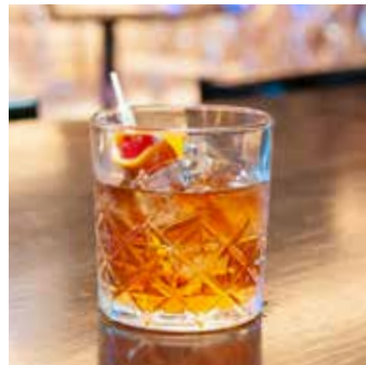
BOBBY BURNS $20.5 Glenlivet 12, Martell VS, Benedictine, Dolin Sweet Vermouth and Peychaud's Bitters