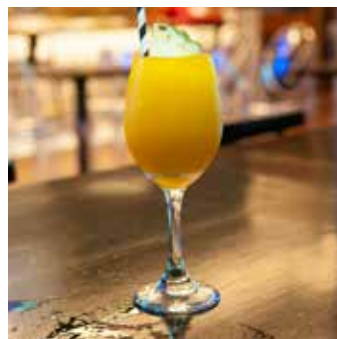
PINA MANGO $16