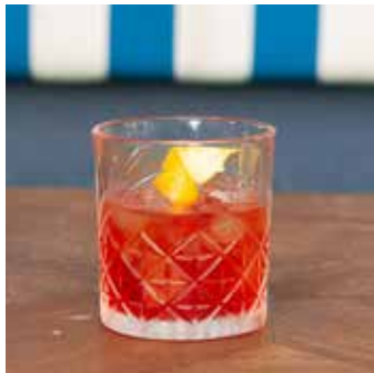
CLASSIC NEGRONI $20 Gin, Campari & Carpano Antica Formula.