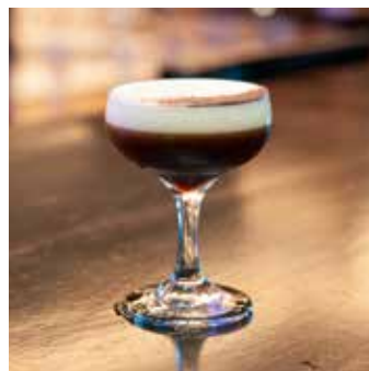
ESPRESSO MARTINI $20 Vodka, coffee liqueur & organic Byron Bay Coffee.